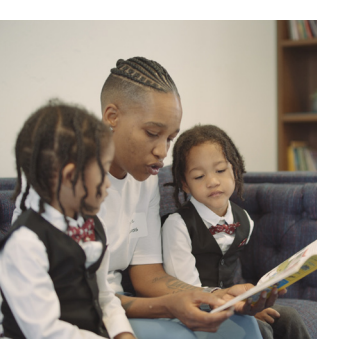
AFTERSCHOOL PROGRAMS No cost, with tutoring, & educational therapeuitc groups