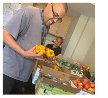
FOOD PANTRY available to all residents & community at large