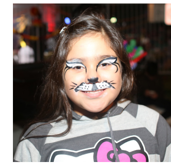
FAMILY SERVICES parenting classes, cultural & youth activities