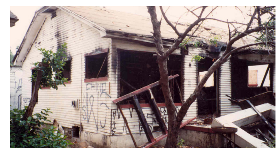
Andrew's Bungalow Court before restoration