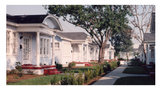
St. Andrew's Bungalow Court after restoration